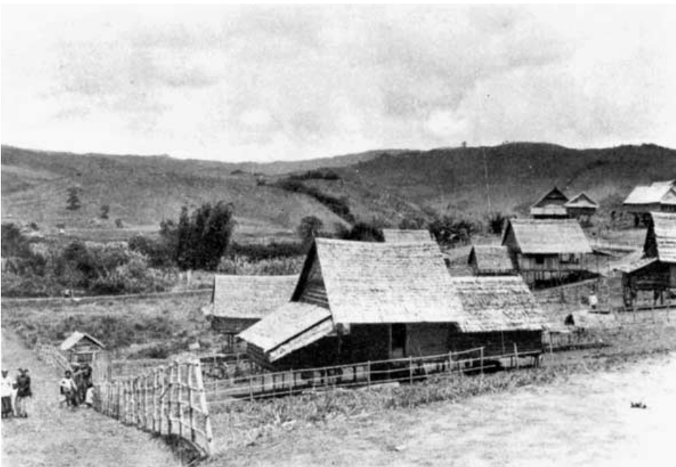
Figure 3. Tentena (on Lake Poso) with fire-climax grasslands in the background, c.1930.