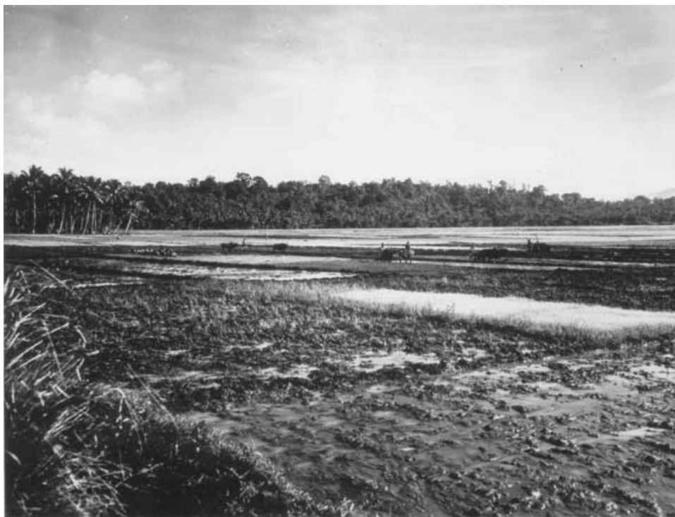
Figure 4. Irrigated ricefields near Tondano (Minahasa), 1945. Source: KITLV (Photo 6675) Reproduced by permission of the Royal Netherlands Institute of Southeast Asian and Caribbean Studies (KITLV)

the local economy as it was in Minahasa (Van de Velde van Cappellen, 1857: 50–51). Given the less terrain and long coastlines of the Sangir islands, however, the main export product here was not rice, but coconut oil for use in mainland Sulawesi and the Moluccas as cooking or lamp oil. The process of agricultural intensification, accordingly, proceeded not by means of irrigation, but rather towards a more or less integrated combination of permanent coconut gardens with a foodcrop farming system based on tubers, bananas and sago. 32