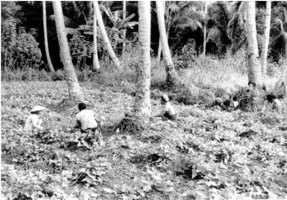
Figure 5. Women weeding a crop of sweet potato growing beneath old coconut palms in Sangir-Talaud, 1979.

( Volkstelling 1930 , V: 156). As the remaining fallow woodland made way for permanent stands of coconut trees with nutmeg or foodcrop understoreys, swidden farming was increasingly confined to land at altitudes more than 500 m where coconuts, as on the plateau of Minahasa, did not yield well. 37 The commercial arboriculture which replaced swiddening, however, was at least as sustainable. In 1920 an official of the Dutch colonial forestry service, an organisation usually intent on preserving forests against any kind of agricultural expansion on ecological as well as economic grounds, was uncharacteristically sanguine about the likelihood of soil erosion, landslides and flooding in thoroughly deforested Sangir. 38