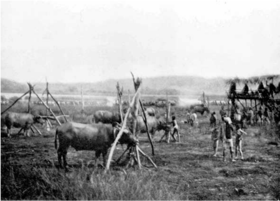
Figure 2. Water buffalo awaiting slaughter at a funeral feast, Poso area, c.1910.